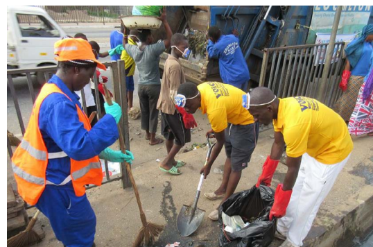
VOiCE volunteers join other Accra youth in solid waste disposal programs to help clean up their neighborhoods.