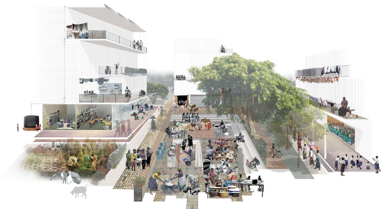
Preview of Urban Design Lab's courtyard designed for women's empowerment, in upcoming UDL/MCI publication.