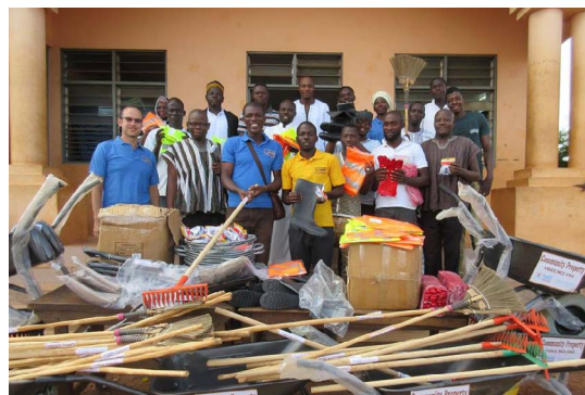
Nima youth gather in front of newly renovated Youth Center.