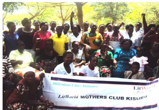
Kisumu Mothers' Club participants work together to foster independence and build community.