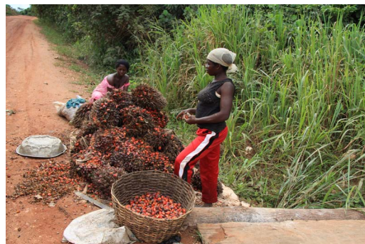
Ghanian women sort palms, part of the process in cultivating oil palm - a promising sector poised for investment, as identified by the project.