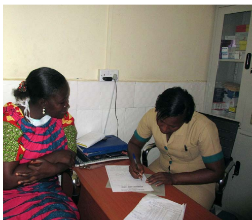
Paperwork completed at Bantama Market Clinic.

In January I shared with you all the exciting news about our new women's clinic in the Bantama Market, which MCI was able to establish right in the heart of Kumasi, with support from the Kumasi Metropolitan Assembly and Health Directorate (KMA and KMHD, respectively).