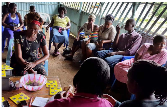
GS&L group shares progress update with representatives from our sister Millennium Villages Project.